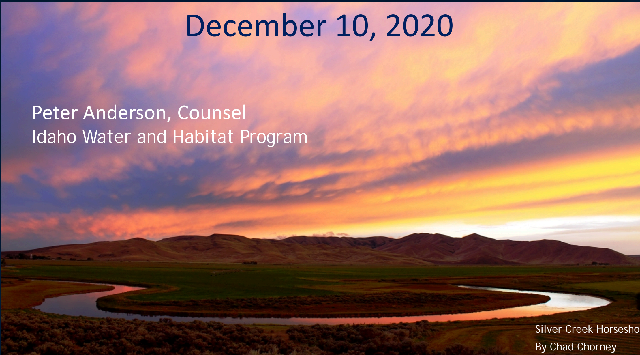
Silver Creek Horseshoe