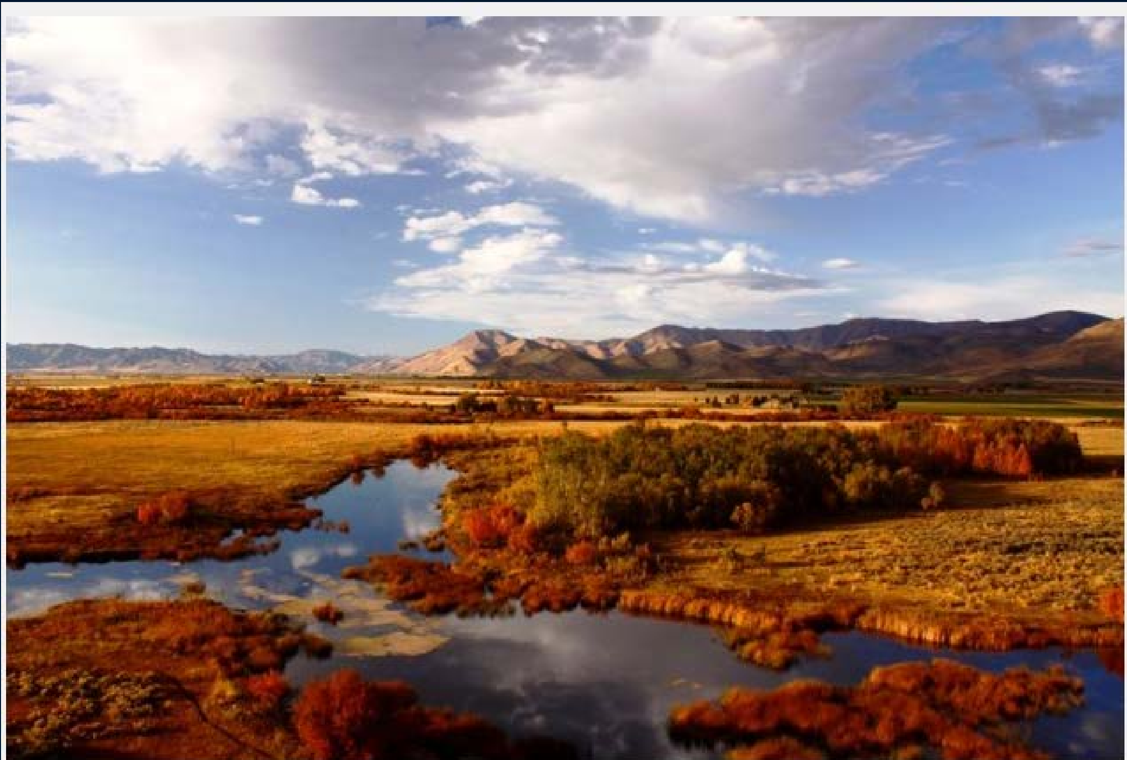
Silver Creek in the Fall.